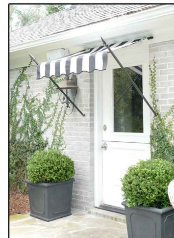
Photo Shown has Custom Arm Lengths

1111 S. Talbot St. St. Michaels, MD 21663